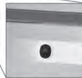
Available with a Discreet Built-in Camera

Dimensions include 1/4" (6mm) mounting bracket