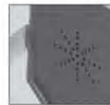
Available with a Built-in Sounder