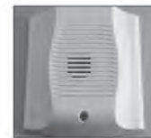
External Sounder provided with base model (DE8310)