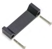
Extension SD-995C-LE25 shown