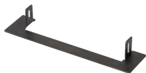
Trim plate (included)