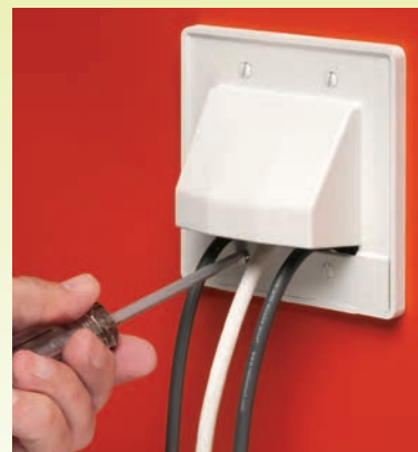
CER2 with Scoop facing OUT. Lower plate secured.

Each of our SCOOPs mounts directly to the wall with drywall screws. For added support, mount to one of Arlington's low voltage mounting brackets; LV1 to LV4.