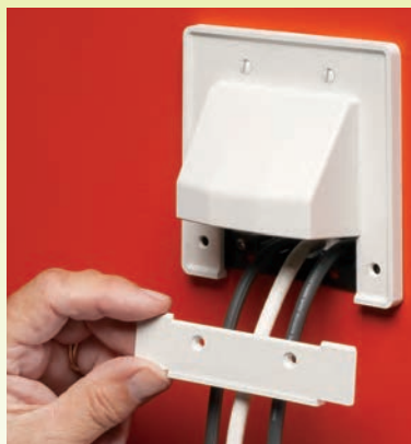
CER2 with Scoop facing OUT. Lower plate removed.