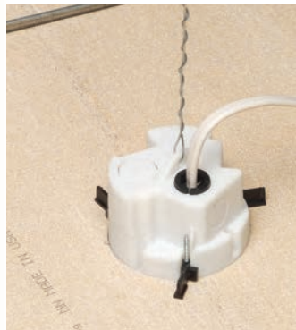
4 Choose the appropriate knockout (1/2" or 3/4"). Install supplied NM cable connector. Pull cable.