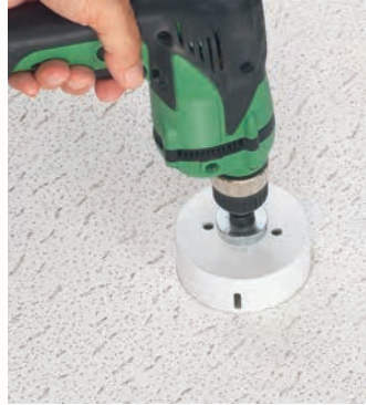
1 Cut hole in the desired location in the ceiling with a hole saw.

Installing a fixture with Arlington's CAM-LIGHT™ Box is quick, easy and secure.