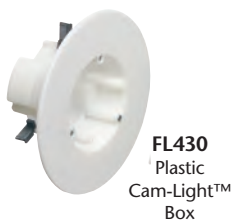
FL430 Plastic Cam-Light™ Box