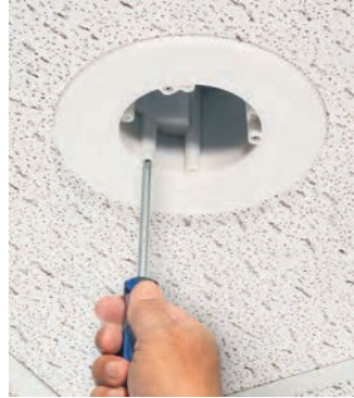
2 Align fixture as necessary. Tighten mounting wing screws.