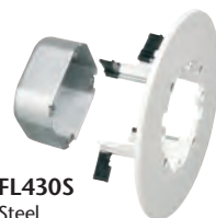
FL430S Steel Cam-Light™ Box with plastic flange