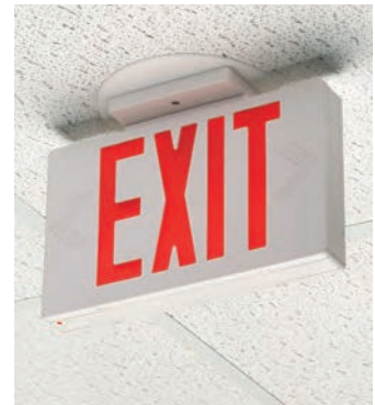
6 Finished installation on suspended ceiling. 50 lb rating with a drop wire. Secure, no sagging ceiling.