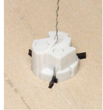
3 Attach drop wire to loop. Attach to framing member for 50 lb rating.