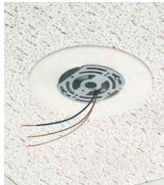
5 Ready for installation of fixture or detector.