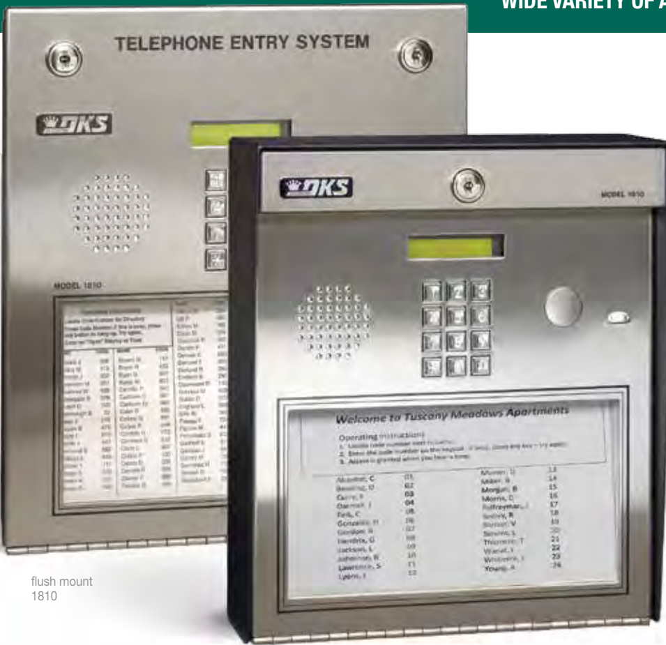
flush mount 1810

THE BUILT-IN DIRECTORY MAKES THE 1810 SUITABLE FOR A WIDE VARIETY OF APPLICATIONS AND IS EASILY UPDATED