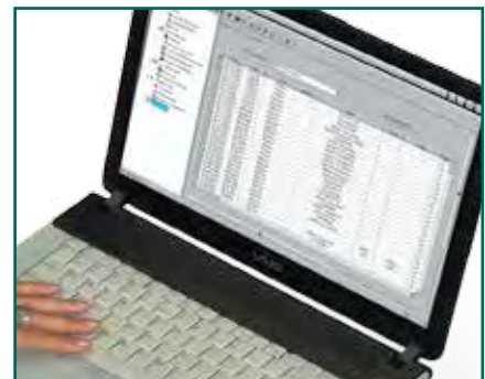
pc programmable Program the 1810 Access Plus from your PC