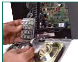
modular design makes installation and service easy