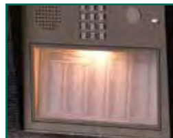
led lighted directory display