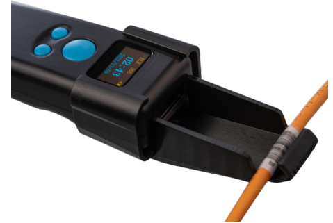
Bluetooth®-enabled handheld barcode scanner and pre-labeled cable